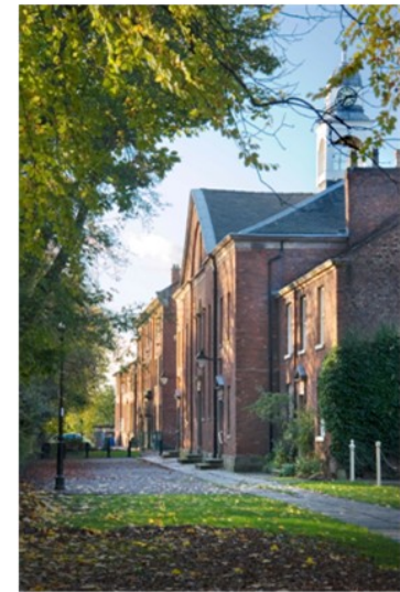
Fairfield Square 1785 and today

Key Walking Route to follow ----- See overleaf for explanation of numbers Time: leisurely 45mins