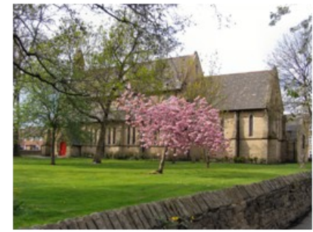
St Mary's Ashton Road