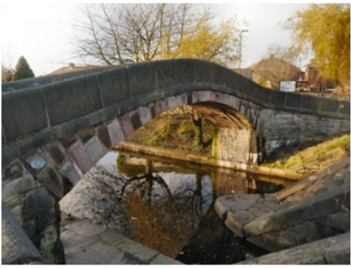
Camel Hump Bridge