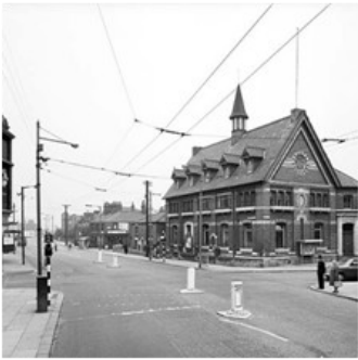
Old Droylsden Town Hall