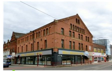
Old Co-Operative building, corner Market St & A662